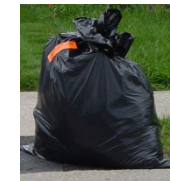
Waste Pickup ↓