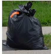
Waste Pickup ↓