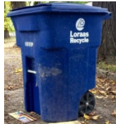
Recycle Pickup ↓